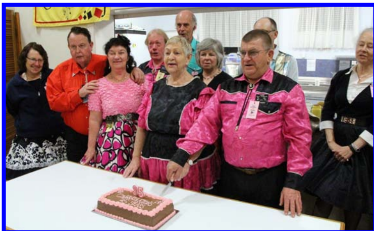
Willi Whirlers NSW celebrating 35years

XI. For some, square dancing can be a strenuous exercise. If you feel you are unable to dance, sit out. It is usually best to remove yourself from the dance area and return after the bracket has started. Sometimes you can learn a great deal just by watching and listening. Be considerate. If another dancer is watching and listening, don't insist upon talking. Square dancing is a social event but not a place to socialize during a bracket or rounds even if you are not dancing.