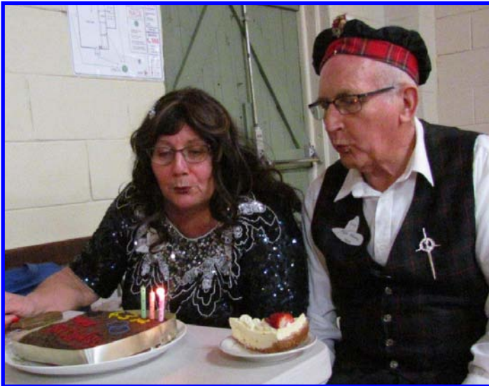
Sussex/Shoalhaven NSW celebrating their 43rd Birthday