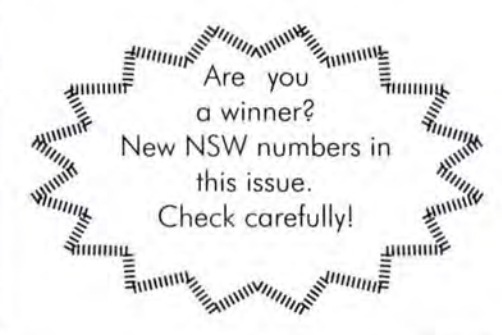
Review October 2012