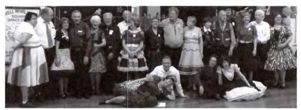
Callers and their Partners at the QCA Gala Dance and Sunshine State Round Up.