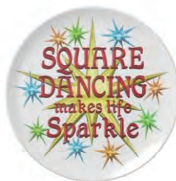
Maryborough Club Qld