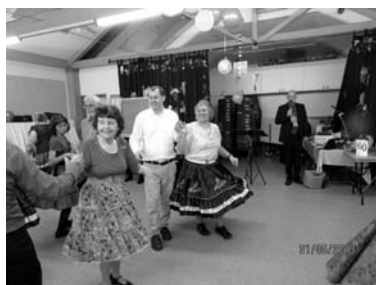
Casino Beef Week