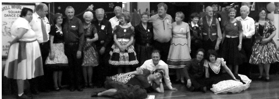
Callers and their Partners at the QCA Gala Dance and Sunshine State Round Up.