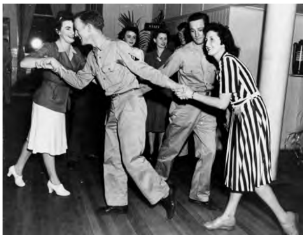
Square Dancing 1943 Brisbane