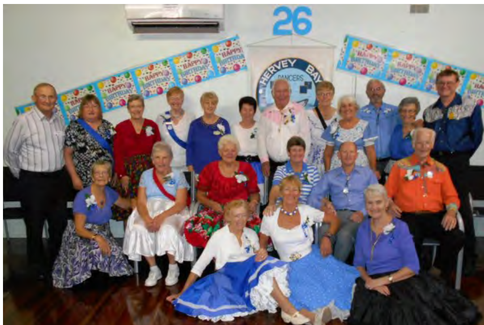
Hervey Bay's 26th Birthday celebration

Ker-Ly-Qs celebrated their 37th birthday with the theme 'Winter Wonderland' The night was well attended [5 squares] with many dances dressed for the theme, including four penguins hatching eggs, Frostie the snowman, and of course, Queen Elsa, from the movie 'Frozen'.