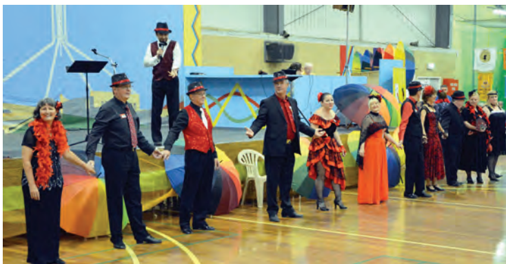
56th National Convention Committee inviting dancers to the Cabaret in Adelaide.