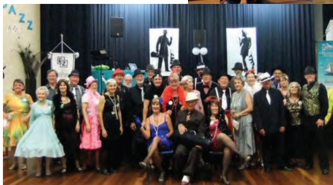
Queensland Snakes Alive Roaring Twenties Dance Night