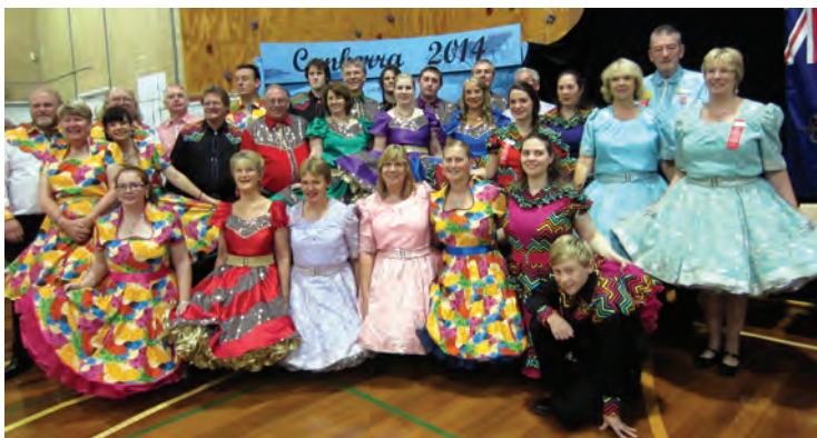
JB Square Wheelers Dressed Sets from Victoria