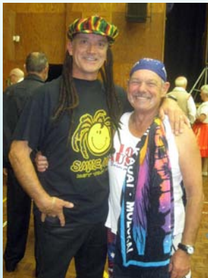
You never know who or what you will meet at a National Convention.