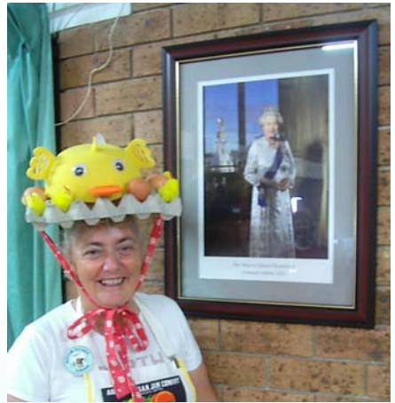
A right royal crown to celebrate Queen Elizabeth's birthday