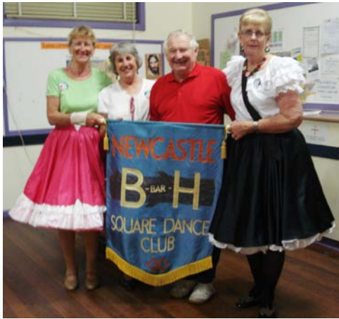
Hervey Bay visit B Bar H