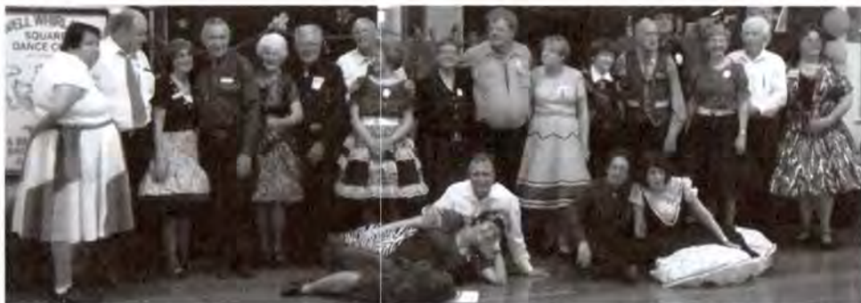
Callers and their Partners at the QCA Gala Dance and Sunshine State Round Up.