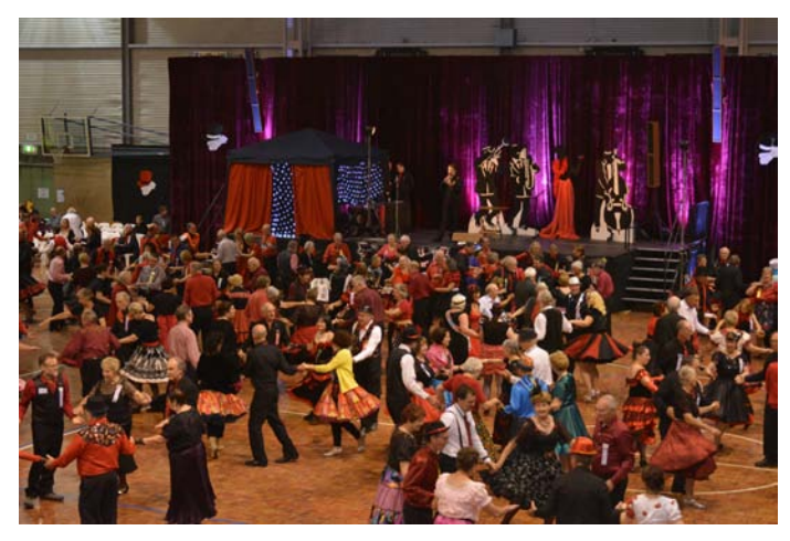
Callers and cuers at 56th National Adelaide.