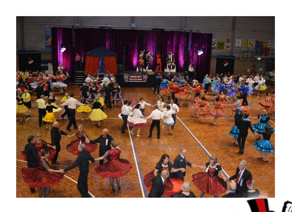
56th National Convention Square Dance Adelaide