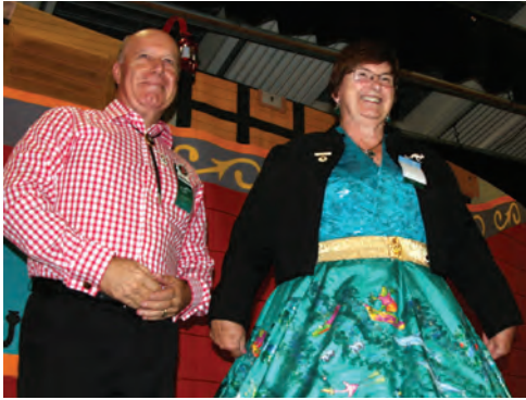
The new and past president of Square Dance Society of NSW