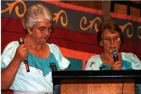
35th NSW State Convention Salamander Bay