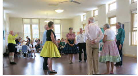
The new Just Bliss Square Dance Club