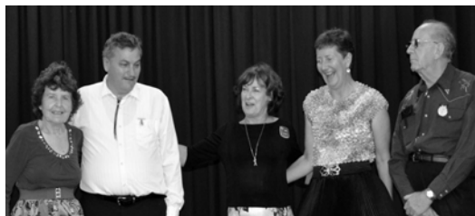
NSW Cuers participating in Choreographers Showcase