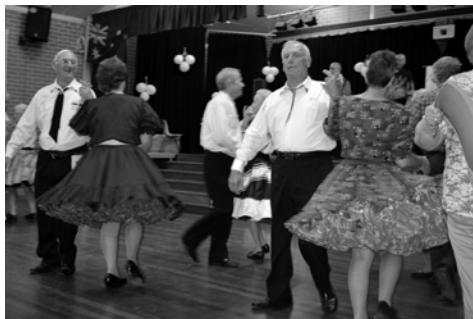
Below Top Cats