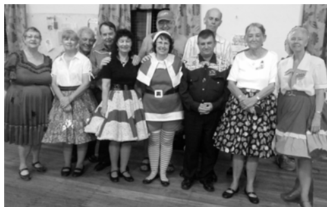
Above Willi Whirlers