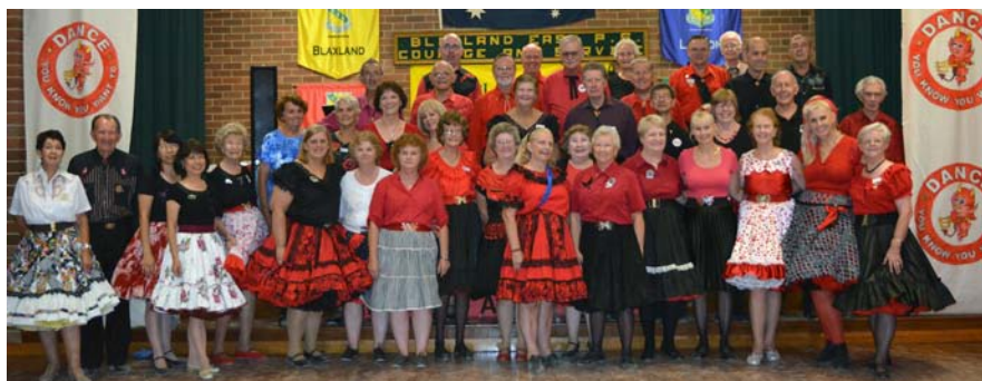
Mountain Devils 19th Birthday