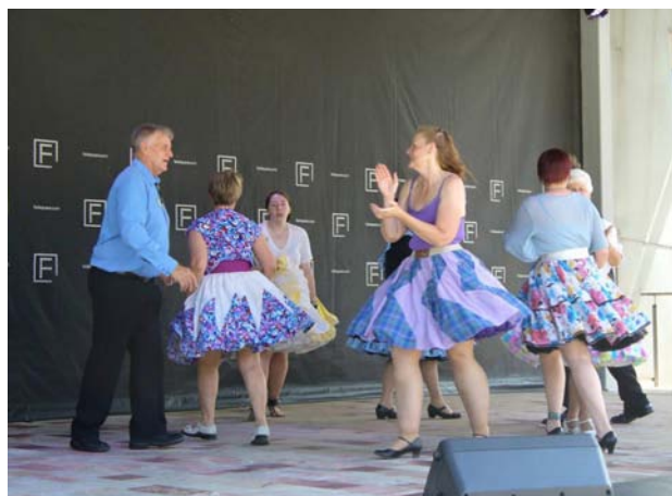
Federation Square Demonstration Melbourne