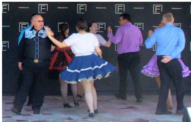
Demonstration Federation Square Melbourne Victoria