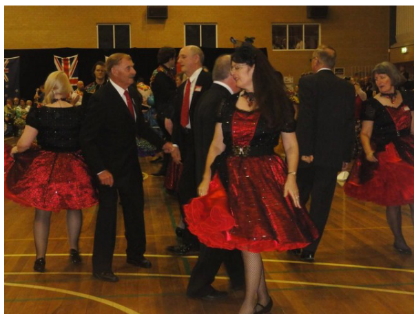
South Australian Convention Committee Dressed set