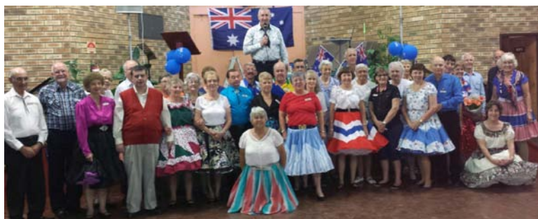
Wavell Whirlaways at Enoggarah, Queensland