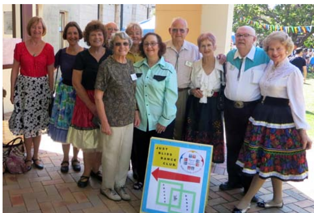
A group of "JUST BLISS" Dancers at the local St Judes Church during its recent Fete Day Dancers performed superbly. Well done to all involved.