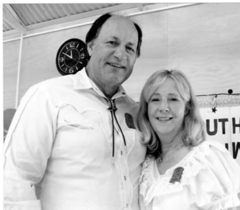
Southern Ocean Waves 19th Birthday

We had a few people away on holidays and busy with visitors, so have not been able to have plus for awhile.