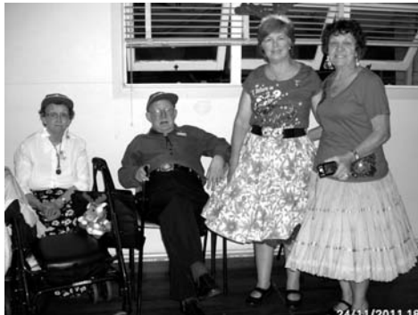
Northern Waves Lismore Christmas: