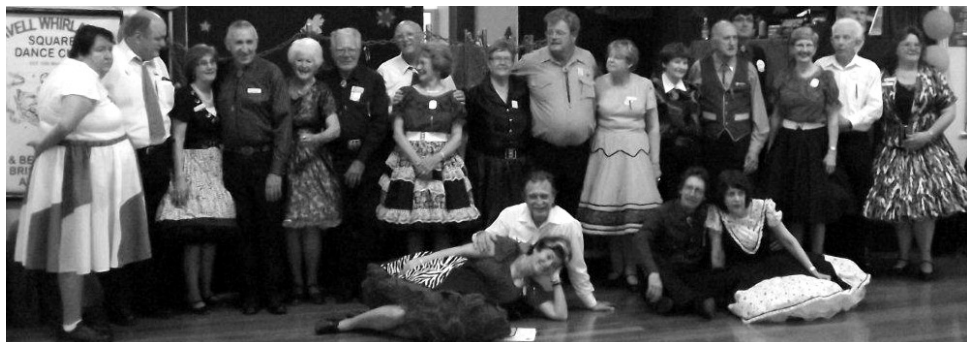
Callers and their Partners at the QCA Gala Dance and Sunshine State Round Up.