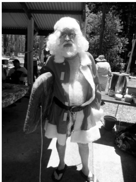
EZ SQUARES SANTA