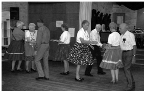
Summerland Larrikins Xmas Party