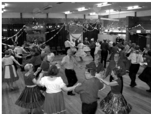
Mountain Devil's Christmas Party