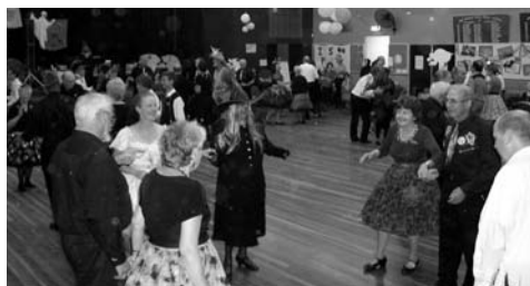
NSW Society Dance