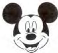
Gary Mouse straight from the Hobart Convention