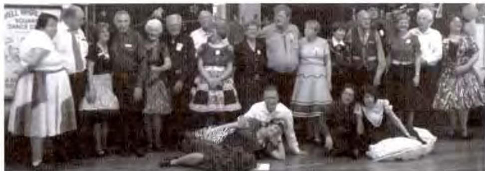
Callers and their Partners at the QCA Gala Dance and Sunshine State Round Up.